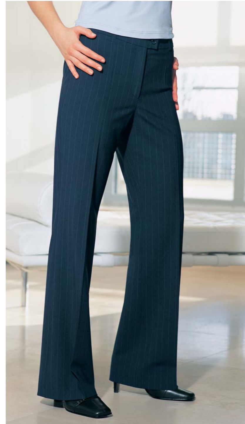
Levanto Trouser , parallel leg trouser, front fastening, low waist, 1 waistband pocket, stretch (comfort) waistband. Sicilia Stretch Top , (see page 72).