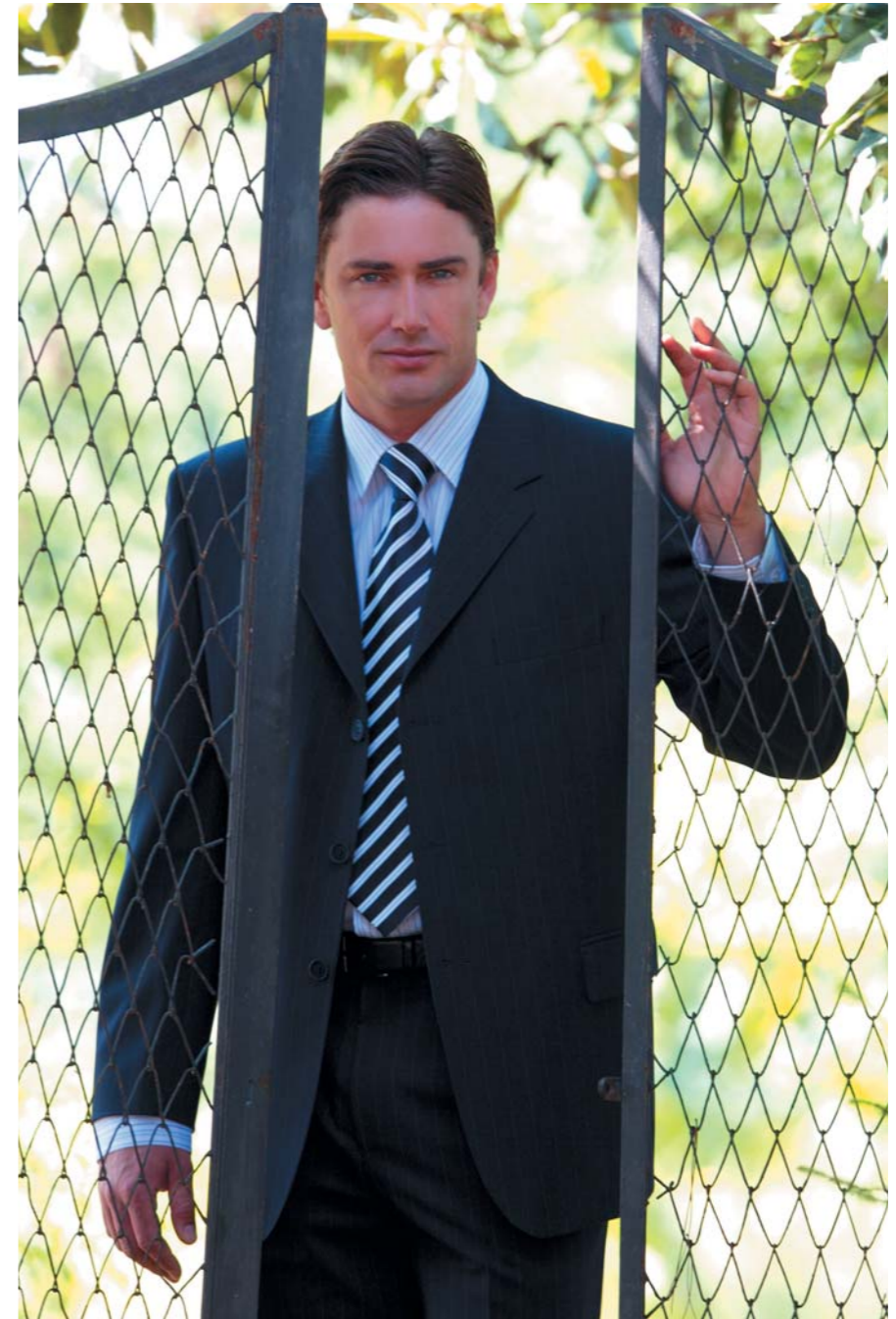
Warwick Jacket, single breasted 3 button jacket. Tailored in superb textured rib fabric with Lycra. Warwick Trousers, single pleat trousers. Bareggio Shirt, (see page 69)