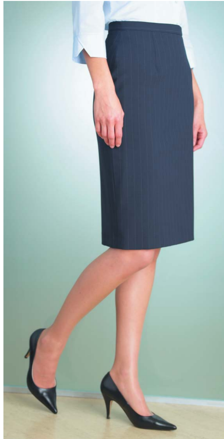
Sorrento Skirt , straight skirt. Centre vent, fully lined, stretch (comfort) waistband.