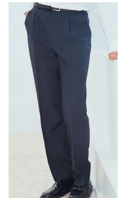
Warwick Trouser , single pleat trouser, stretch (comfort) waistband.