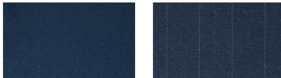
A - navy

Fabric: 60% Wool, 38% Polyester, 2% Lycra Bi-Stretch