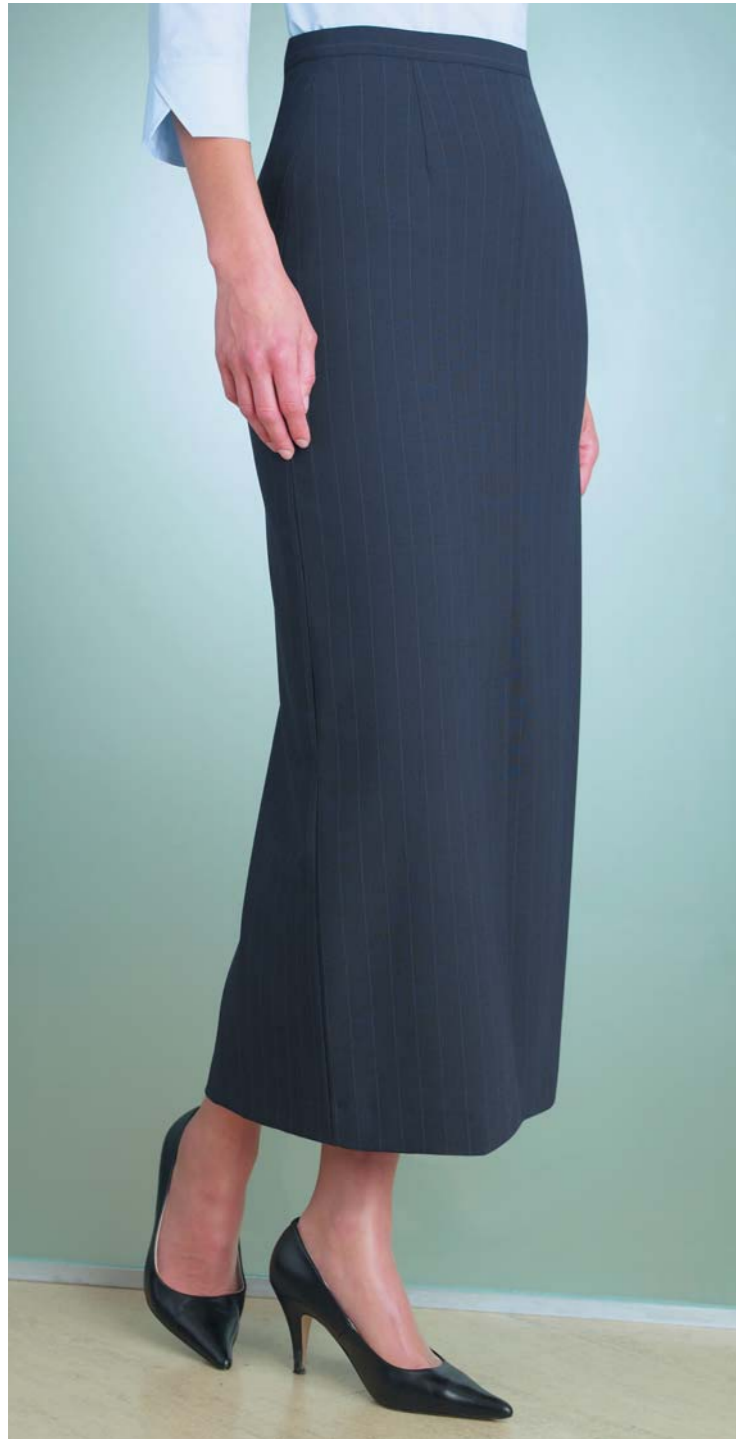
Sondrio Skirt , long line skirt, 14" centre vent front and back, stretch (comfort) waistband.